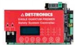
Eagle Quantum Premier® Safety System