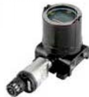
FlexVu® Universal Display with GT3000 Toxic Gas Detector