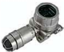
FlexSonic® Acoustic Leak Detector