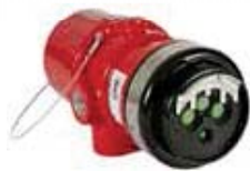
X3301 Multispectrum IR Flame Detector