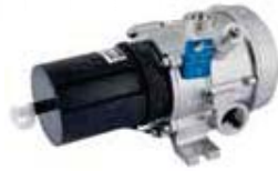
PointWatch Eclipse® IR Combustible Gas Detector