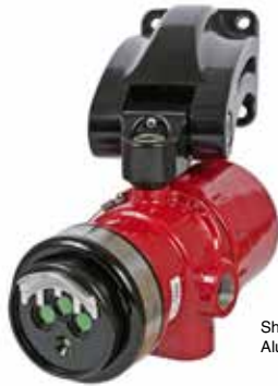
Shown with Q9033A Aluminum Mounting Arm