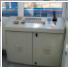
Control Console in situ