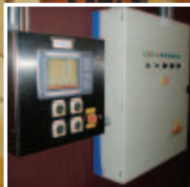
Vegetable Store Control