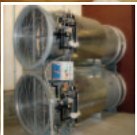
Fan and Burner Control