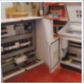
Power Control System